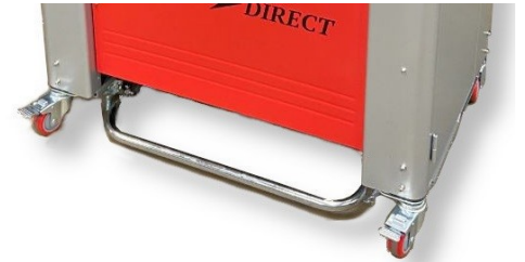
Front foot bar switch and photo eye