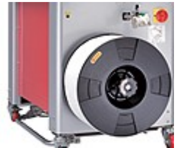
Waist High Auto Strap Feeding