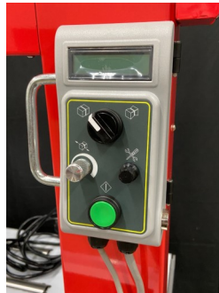
Turning Operating Control Panel