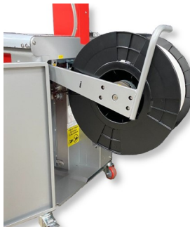
Waist High Quick Coil Change